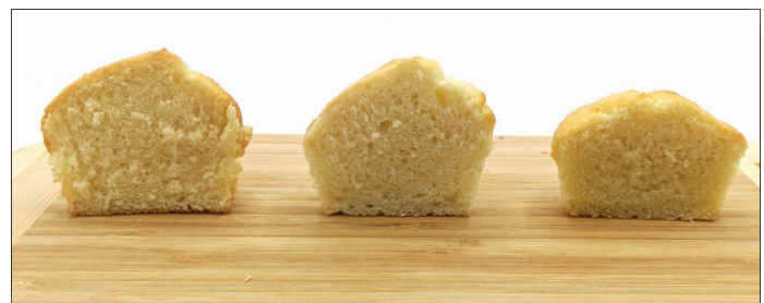
From left to right: Conventional muffin, gluten free muffin with JRS USA fiber, gluten free muffin without JRS USA fiber.